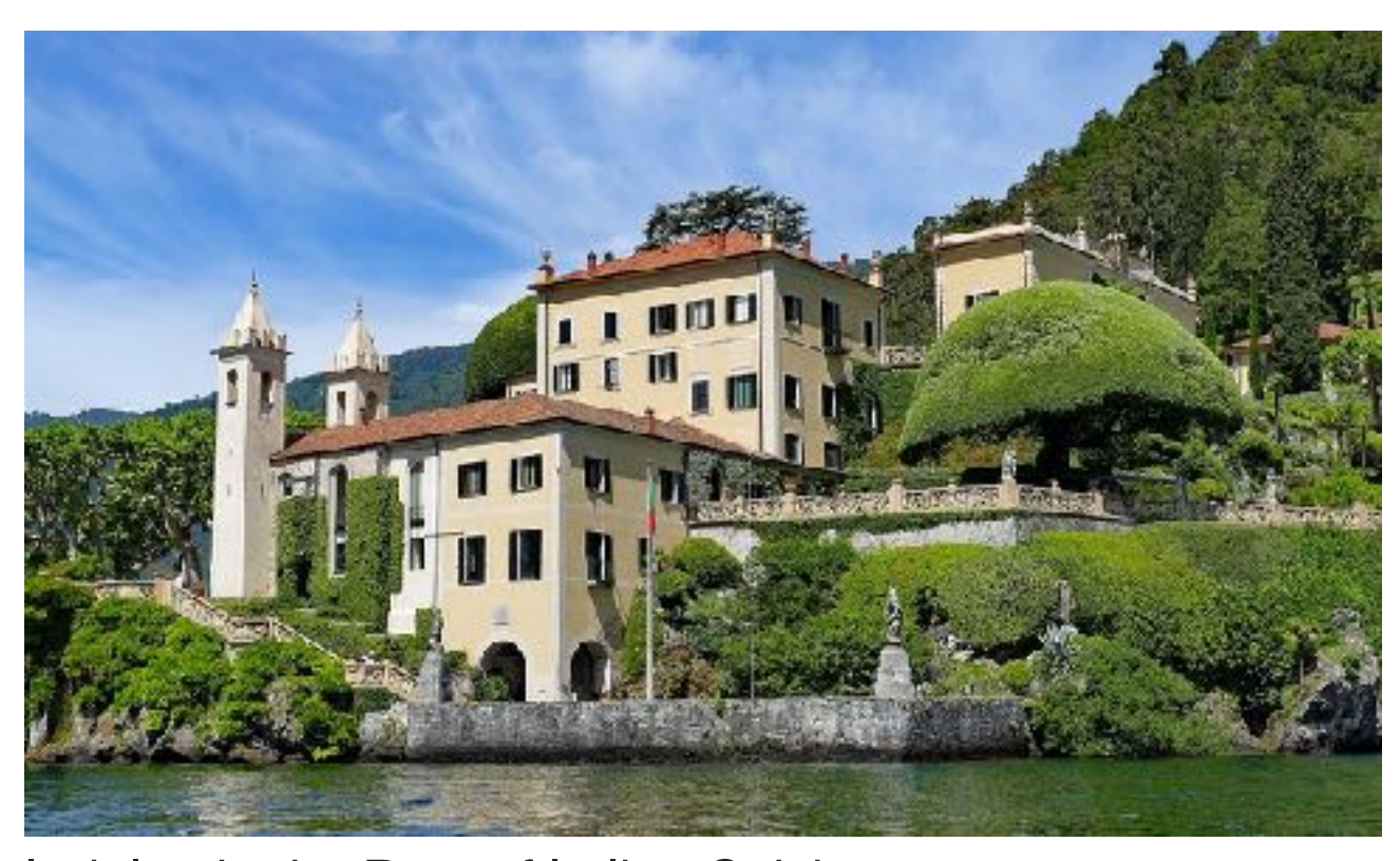
Indulge in the Best of Italian Cuisine

Lake Como isn't just about stunning scenery; it's also steeped in history and culture. Explore charming villages like Bellagio, Varenna, and Menaggio, each brimming with cobblestone streets, historic landmarks, and welcoming trattorias. Visit elegant villas like Villa del Balbianello, where history and glamour intertwine.