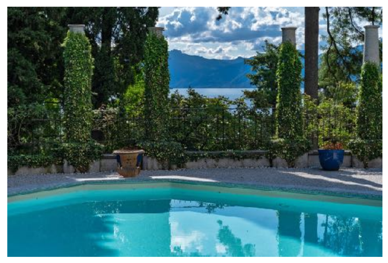
Getting Around Lake Como

Lake Como boasts a Mediterranean climate, with warm, sunny days and pleasant evenings during the summer months. Temperatures typically range from 25°C to 30°C (77°F to 86°F), making it ideal for outdoor activities and leisurely explorations. The gentle breezes from the lake add to the refreshing atmosphere, ensuring your stay is comfortable and enjoyable.